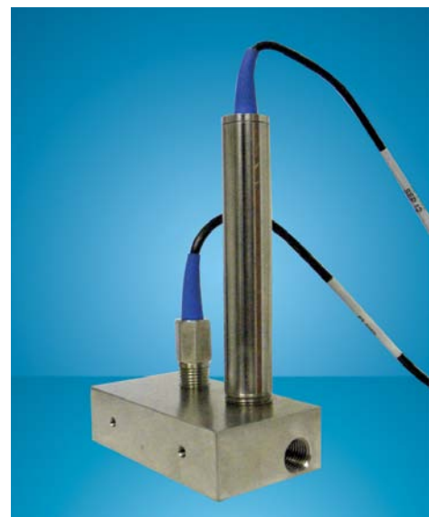
High Purity Water Sensor & Flowcell

Superior Sensor Technology for Advanced Process Measurement.