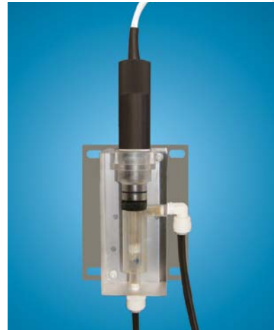
Sealed Acrylic Flowcell