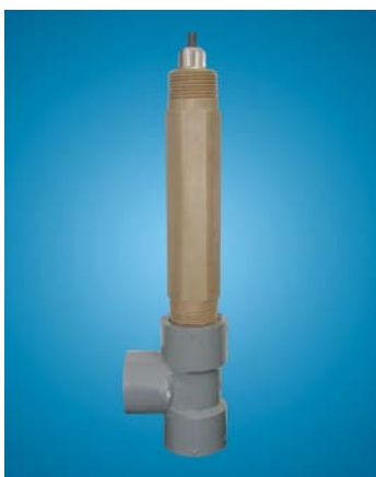
1" Flow Tee

The 1-1/2" or 2" union mount systems can be used with pipe sizes up to 2 inches. The union mount hardware allows for easy removal of the sensor from the hardware without twisting the sensor cable.