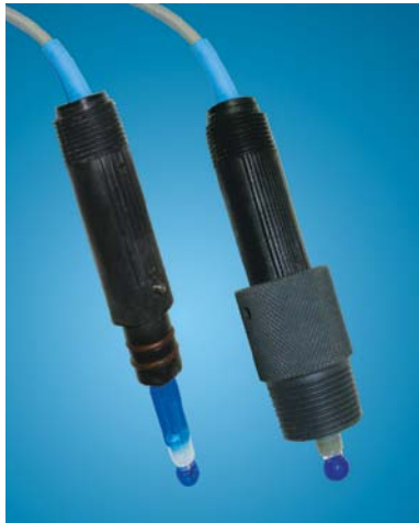
Twist-Lock Sensor (with or without pipe adapter)